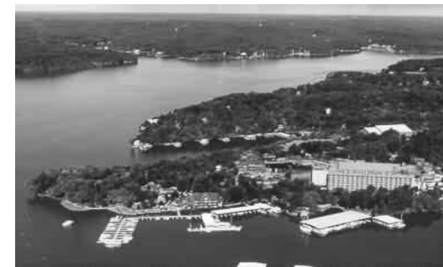
Tan-Tar-A; Don't You want to be here?